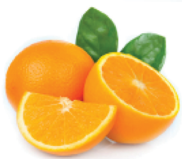
Florida Citrus Production by Ton: Growing Seasons '94-'95 and '09-'10