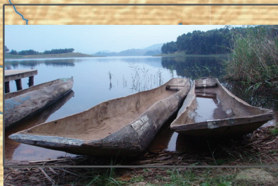
Ancient Dugout Canoe