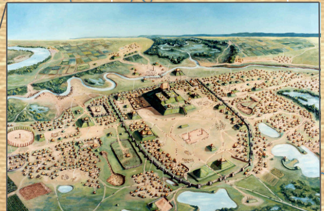
Artist's Rendition of Ancient Cahokia