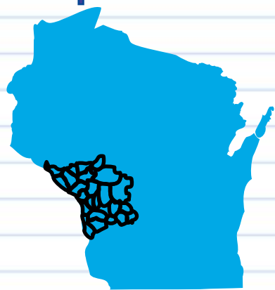
*Locator Map not to scale

Since 2017, school districts in Wisconsin have been cutting salaries for their teaching staff by almost 20%. Strikes between teacher unions and state instructional leaders along with state budget cuts both have been factors in the decrease. This data from the 2018-19 school year shows the effect of the salary cuts in regards to teacher and district performance.