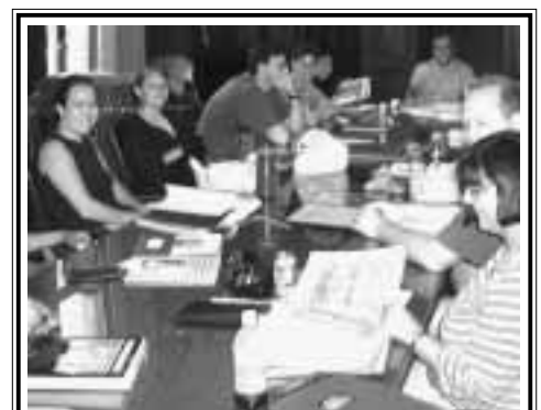
Participants in the Smith Center Summer Institute attending a lunch-time discussion on the History of Cartography Project.

Visit the History of Cartography World Wide Web site at http://www.geography.wisc.edu/histcart