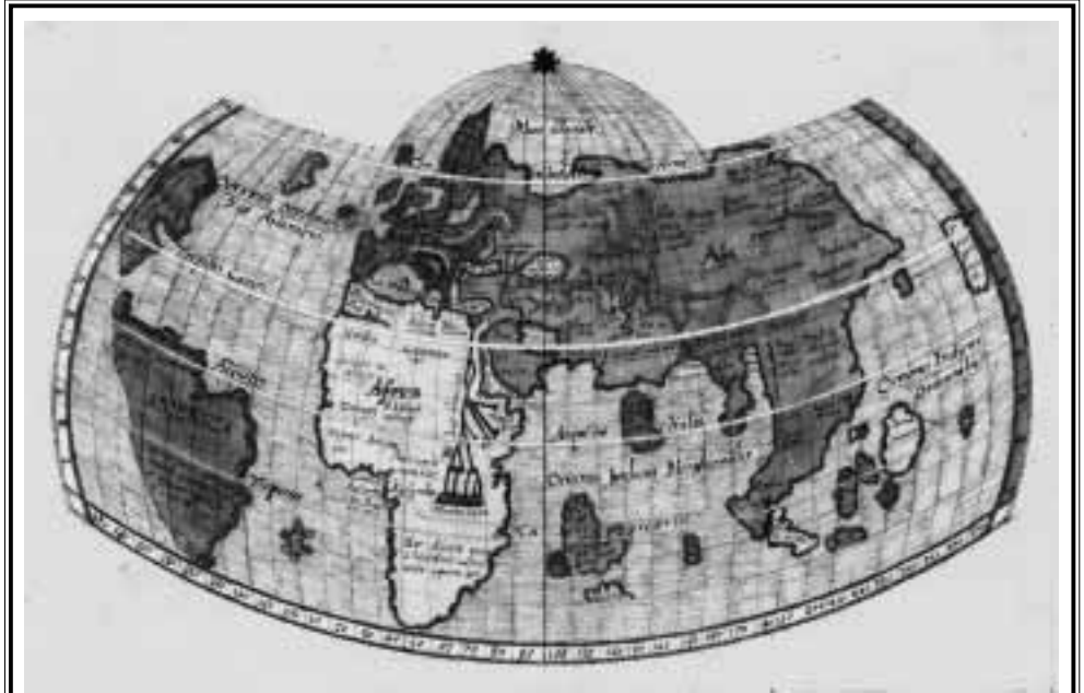
World map from "De geographia," by Henricus Glareanus, Basle, 1527. The text was written shortly after 1510. Glareanus seems to have copied the Ptolemy and Vespucci hemispheres that are inset at the top of Martin Waldseemüller's 1507 world map, Universalis cosmographia, but he

In March we received the excellent news that our proposal to the National Endowment for the Humanities (NEH) for support of Volume Four had been successful; we look forward to two years of much-appreciated outright and matching grant support. As part of our continued planning of the encyclopedic format of Cartography in the European Enlightenment , we asked advisory board members to respond to the headwords and general organization of the volume. Their comments and suggestions have helped us to expand and refine the headword list and to develop a strong team of potential authors. We have also started to prepare scope descriptions for the content of each of the categories of headwords. These, along