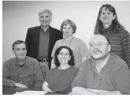
History of Cartography editors and staff met in Madison, April 2004.