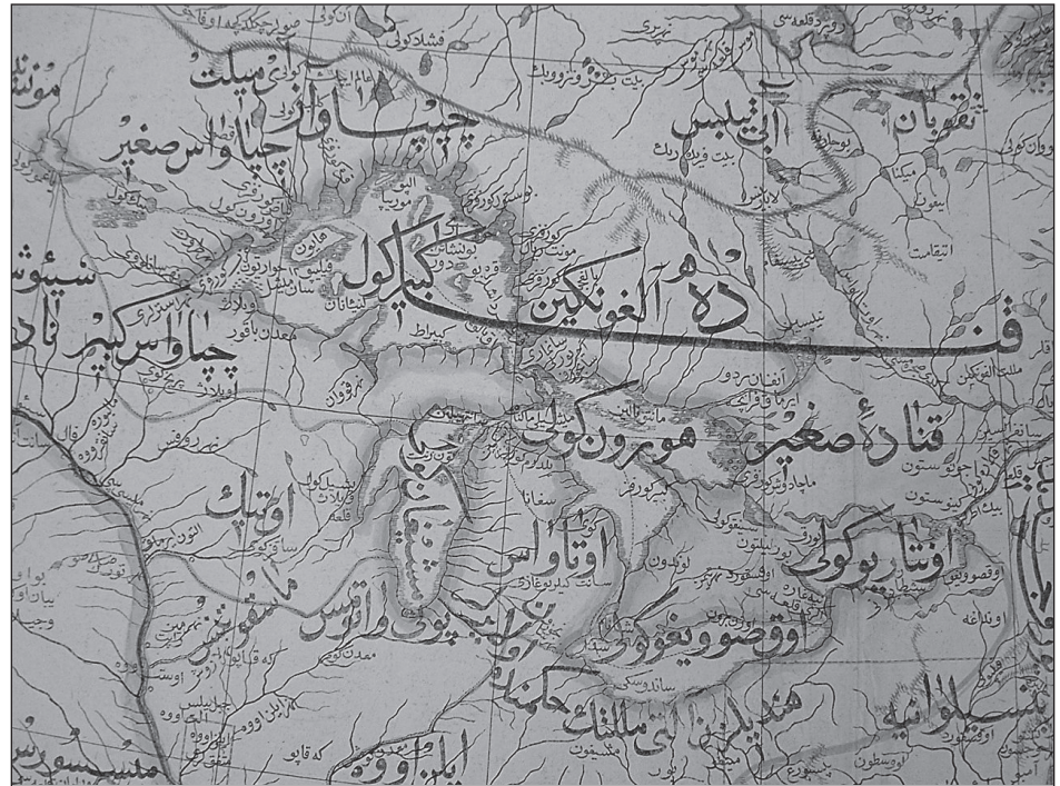
Detail from a map of the western United States, copied from William Faden and published in Istanbul, 1803.