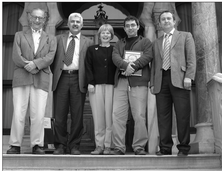
On the steps of the faculty club of Istanbul University, April, 2007.

Snows receded and with spring came a long-planned trip to Turkey during my school's spring vacation. Every Latin teacher needs to see Troy at least once in a lifetime, and this was my opportunity. A visit to Turkey also allowed me to meet our Turkish contributors to Volume Four, who are writing entries on cartography in the Ottoman Empire. This was a particular pleasure for me and for the Project. After nearly two years of correspondence, the chance to meet and exchange ideas about Ottoman cartography was a rare moment of shared east-west enthusiasm for maps. The study of the Ottoman Empire during Volume Four's period (ca. 1650-1800) offers special challenges to historical and cartographic researchers. It is not a glamorous epoch in the history of this empire: historians take the Ottoman defeat at Vienna in 1683