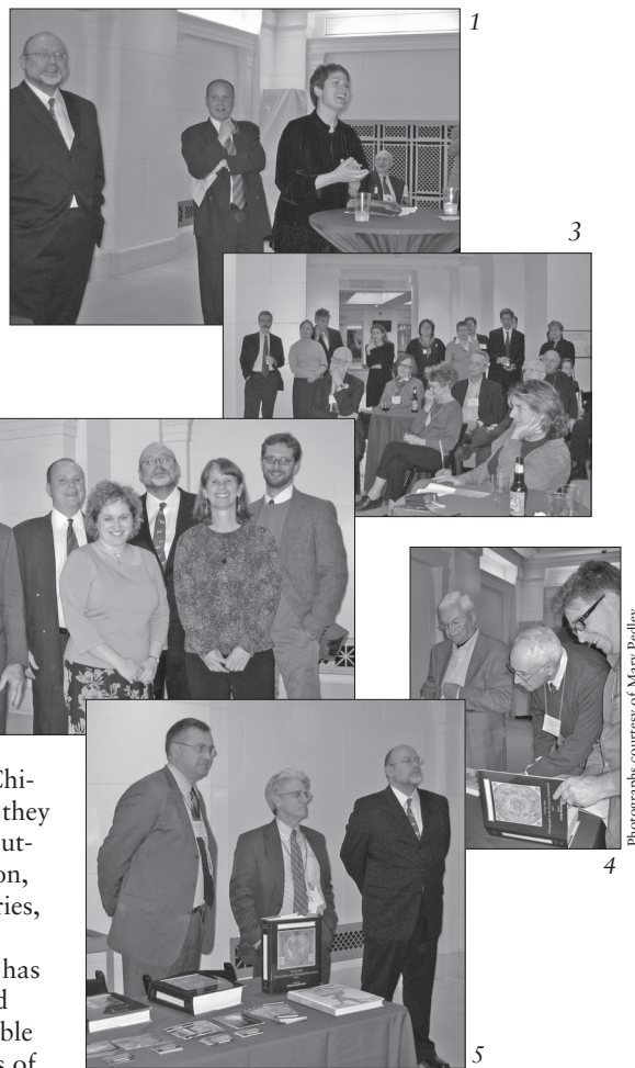
Above, at the November 10th reception: